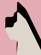
Guard Dog figure